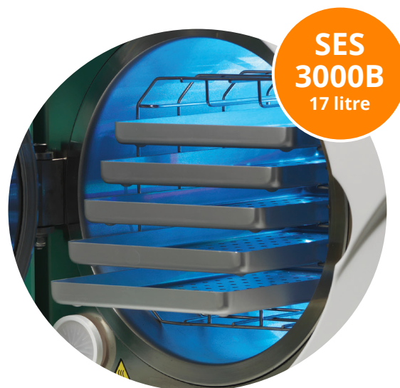
Trays shown for illustrative purposes only

Little Sister SES 3000B autoclaves include: Mains Lead, User Manual, Wall Chart, USB Memory Stick with Cycle Data Download Software and Manuals, Reservoir Drain Tube, Drain Plugs, Tray Carrier, Levelling Kit, Tray Lifter, Pouch Rack Essential Helix Test, 1x Standard Tray (28 cm x 18 cm) and 1x Examination Tray (14 cm x 18cm)