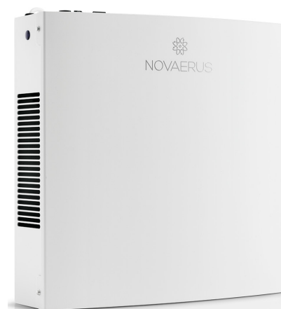
Novaerus Protect 800