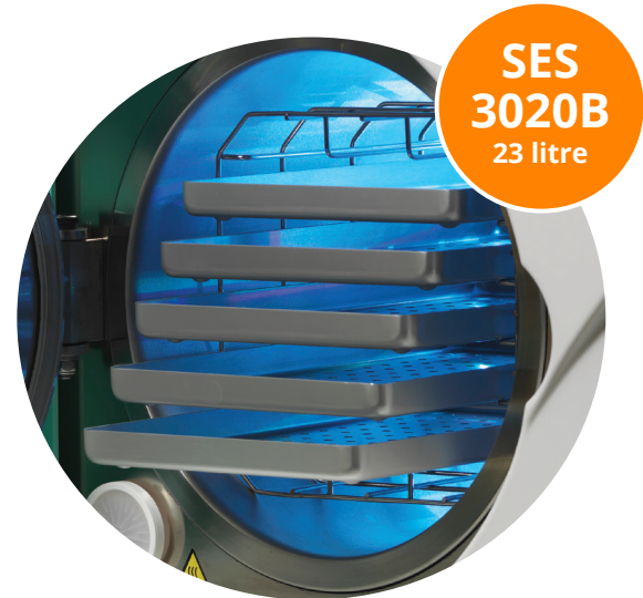
Trays shown for illustrative purposes only