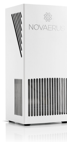
Novaerus Protect 200