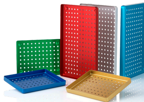
Long Tray for SES 3020B