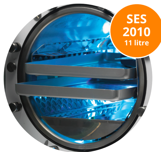
Trays shown for illustrative purposes only

Little Sister SES 2010 Touchscreen autoclaves include: Mains Lead, User Manual, Wall Chart, USB Memory Stick with Cycle Data Download Software and Manuals, Reservoir Drain Tube, Drain Plug, Tray Carrier, Levelling Kit, Tray Lifter, 1 x Standard Tray (28 cm x 18 cm) and 1 x Examination Tray (14 cm x 18cm).