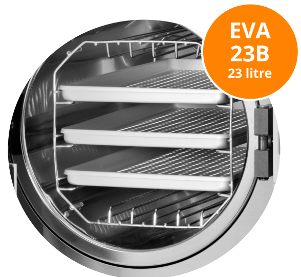
Trays shown for illustrative purposes only

The EVA 23B includes: Mains Lead, User Manual, USB Memory Stick for Cycle Data, Manual, Reservoir Drain Tube, Spare Door Seal, Tray Carrier, Tray Lifter, 3 x Long Tray for EVA 23B (38 cm x 19 cm)