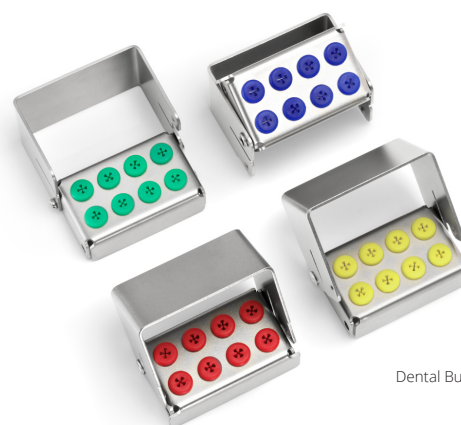
Dental Burr Holder