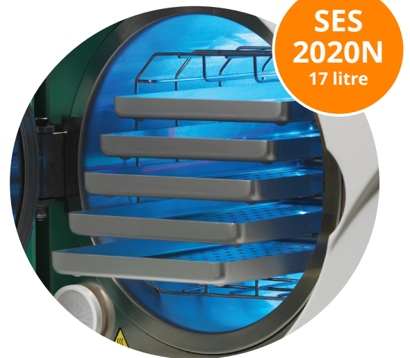
Trays shown for illustrative purposes only

Little Sister SES 2020N autoclaves include: Mains Lead, User Manual, Wall Chart, USB Memory Stick with Cycle Data Download Software and Manuals, Reservoir Drain Tube, Drain Plugs, Tray Carrier, Levelling Kit, Tray Lifter, 1 x Standard Tray (28 cm x 18 cm) and 1 x Examination Tray (14 cm x 18cm).